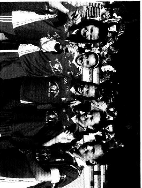
Rang 6 girls at Garda Sports Day